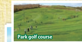
Park golf course