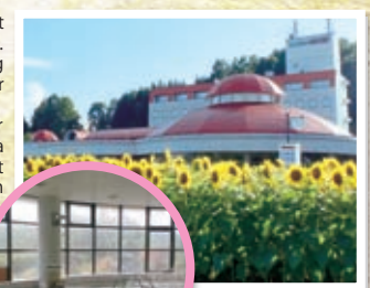
Large hot spring bath

Relish in heavenly relaxation while gazing out upon the beauty of the changing seasons. There's a park golf course in the area, along with a caravan site and field. Why not try your hand at some ice fishing in the winter! All 28 rooms are fitted with WiFi for your convenience. There's a "simple hot spring" (a weak alkaline hypotonic low temperature hot spring) and the sauna equipped with Finnish sauna-stones is also very popular.