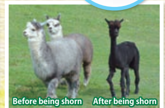
Before being shorn After being shorn